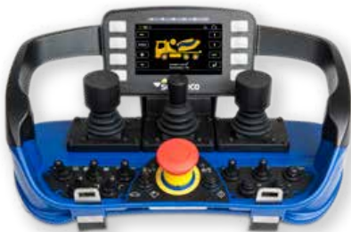
Scanreco Maxi Transmitter

A wide variety of wired and wireless controllers for industrial and mobile systems using the CAN Bus, Profi Bus and HART communication protocols.