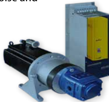
Voith Servo Power Unit