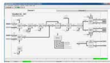
Wandfluh PASO software and SD7 Controller