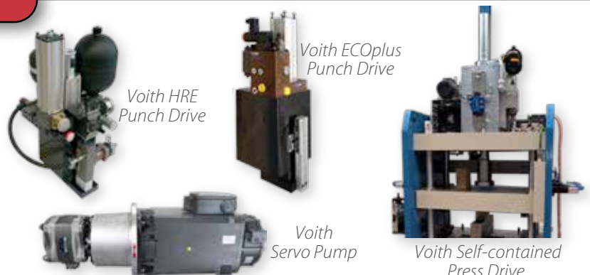
Voith HRE Punch Drive