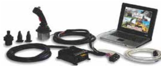
Walvoil WST, PHC and Controllers